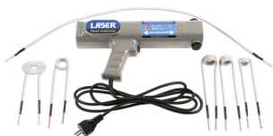
Heat Inductor Kit 7pc (Euro Plug) | 7504