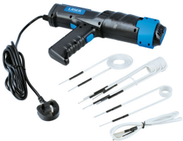
Heat Inductor Kit 1000W (UK Plug) | 8680