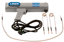
Heat Inductor (Euro Plug) | 5835